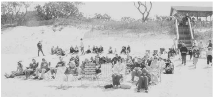
Doing what the pastor cannot do