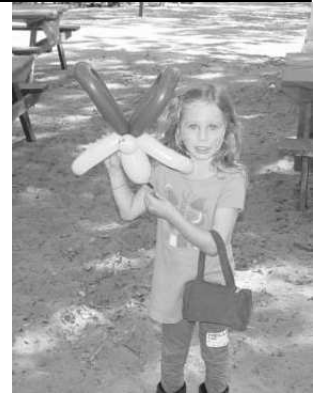
Getting some wind burn