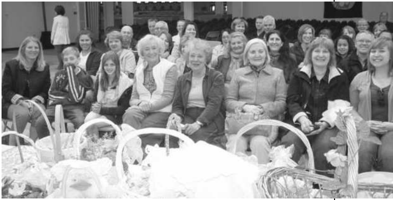
Celebrating the Blessing of Easter Food