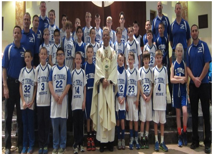
The St. Thomas More CYO Basketball team