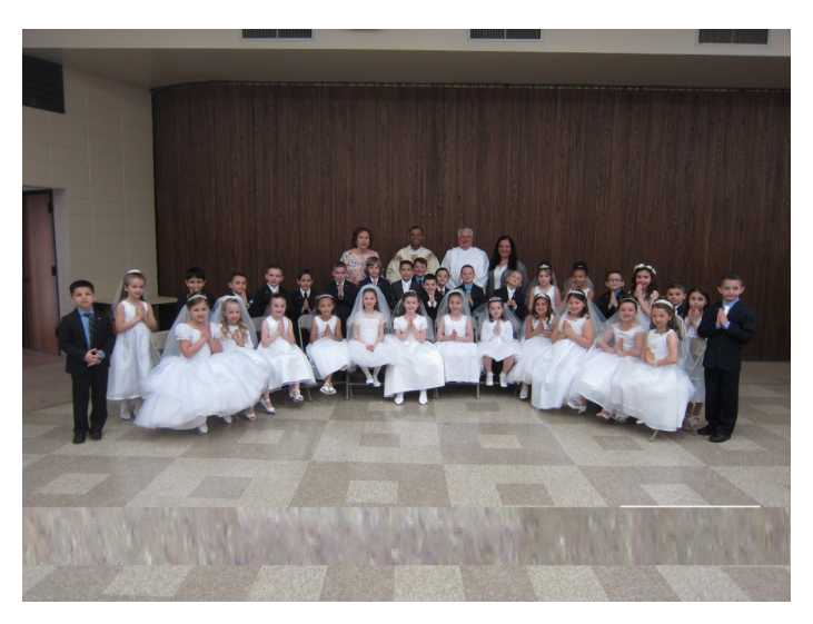
Please pray for our children who received the Sacrament of First Holy Communion last weekend.