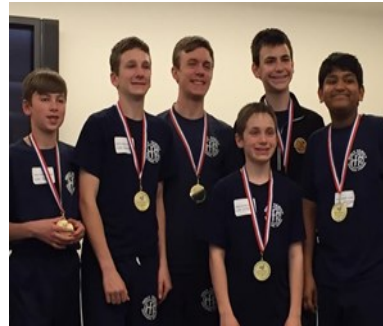
Pictured above are students of Holy Family Regional School who competed in Adelphi University's STEP Robotics competition on May 2nd.

HOLY FAMILY REGIONAL SCHOOL , Commack, New York—Grades Nursery through 8th Grade. You may contact the school at parents@holyfamilyregional.com to schedule a tour of this parish's regional school, or visit the school website at www.holyfamilyregional.com