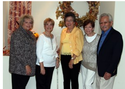
St. Thomas More's RCIA Ministry Team

Have you or anyone you know had that little persistent feeling that you want to be a practicing member of the St. Thomas More Community? God might be inviting you to inquire about the Catholic Church through the RCIA process