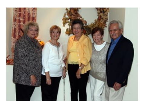
St. Thomas More's RCIA Minis-

For those not baptized or baptized in another Christian church, or baptized Catholics who have never received First Communion or Confirmation, and are interested in the process, please call the rectory at 234-5551. Have you or anyone you know had that little persistent feeling that you want to be a practicing member of the St. Thomas More Community? God might be inviting you to inquire about the Catholic Church through the RCIA process.