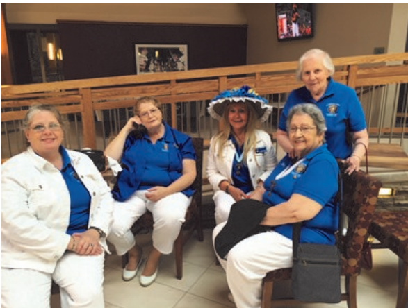
The St. Thomas More Columbiettes at their 2016 Convention.