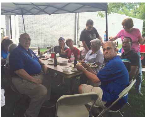
Annual Picnic of the Knights