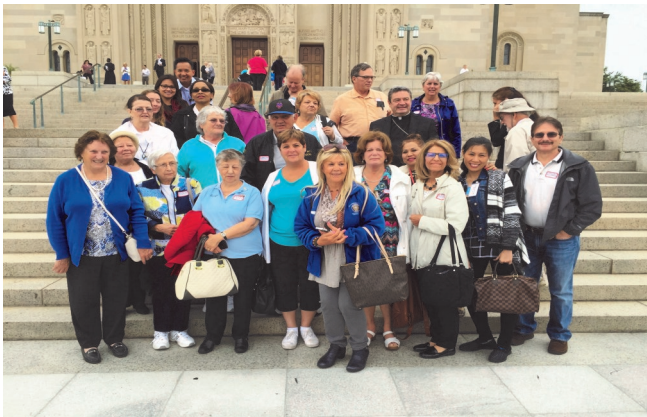
Pilgrimage to the Basilica of the National Shrine of the Immaculate Conception, Washington, D.C. on 9/24/2016.

6pm--Supermarket Bingo--Columbiettes--Kitchen/Walden Hall