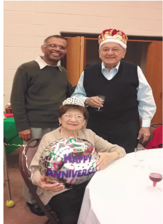
Young At Heart November & December Birthdays