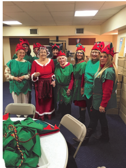
St. Thomas More Elves get ready to perform line dancing.