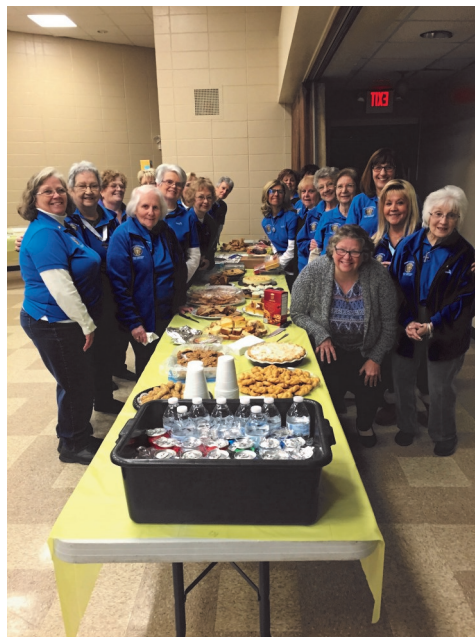
St. Thomas More Columbiettes who hosted their annual Chapter.