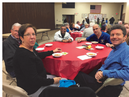
Parishioners of St. Thomas More at the simple Lenten Soup Supper .