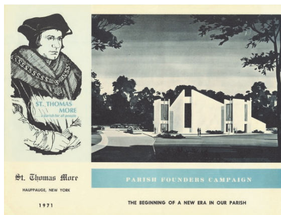
Cover of the pamphlet describing the very first building campaign in the parish.

USING FAITH DIRECT? - It's quick and easy!