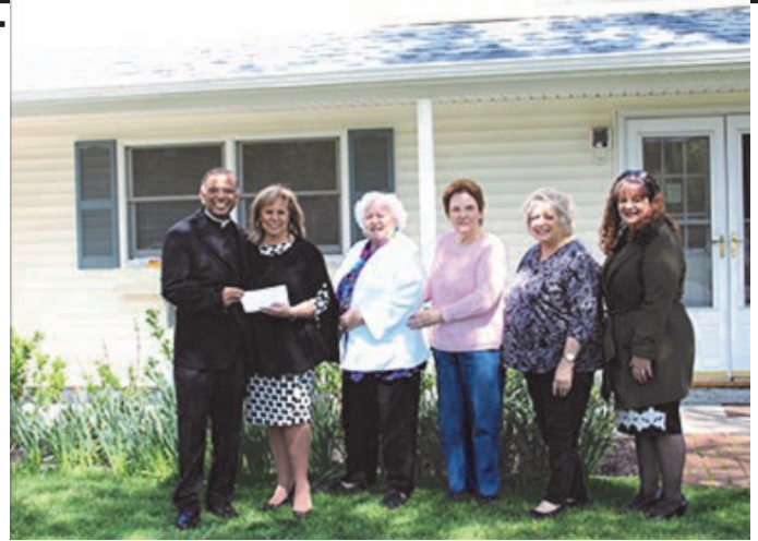
Our heartfelt gratitude to the Bridgehampton National Bank for their generous check to our Outreach Program

On Tuesday, June 6th at 7pm we will be holding registration for all children entering 1st grade this September and for families new to the area. We will meet in the Parish Center. Please bring your child's baptism certificate with you. If you have any questions please call us at 631-234-0397 .