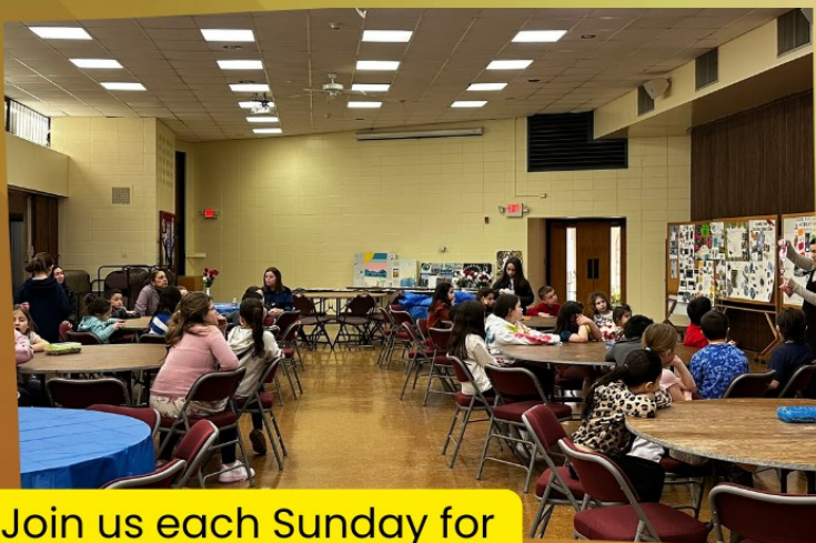
Join us each Sunday for Children's Liturgy! All kids ages 4-8 are welcome!