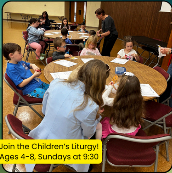
Join the Children's Liturgy! Ages 4-8, Sundays at 9:30