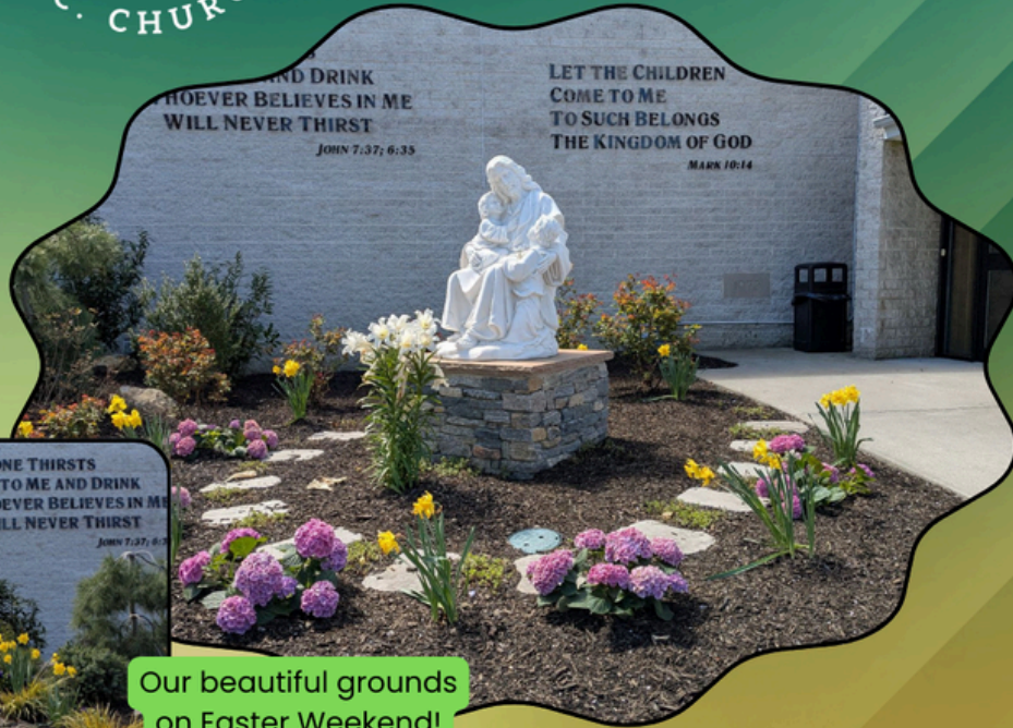
Our beautiful grounds on Easter Weekend!