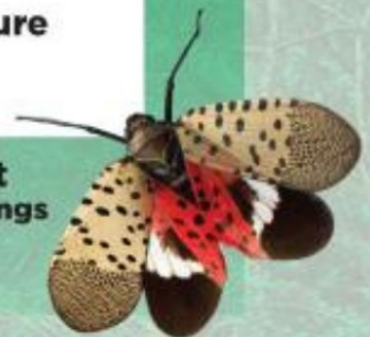
Report any sightings