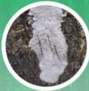
Egg mass Sept.-June

Search for all spotted lanternfly life stages