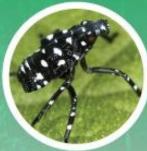
Early nymph April-July