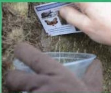
Scrape egg masses into a container of rubbing alcohol or hand sanitizer