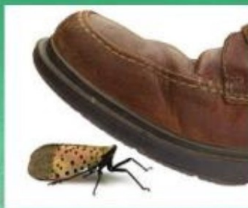
Squash any bugs you see