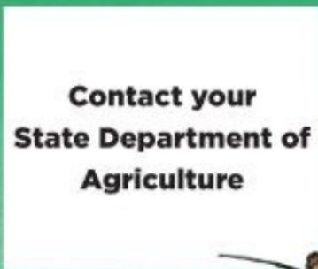
Contact your State Department of Agriculture