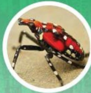
Late nymph July-Sept.