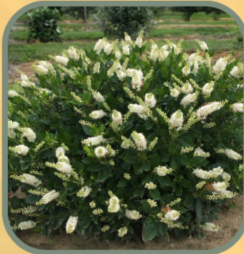
Summersweet ( Clethra alnifolia )