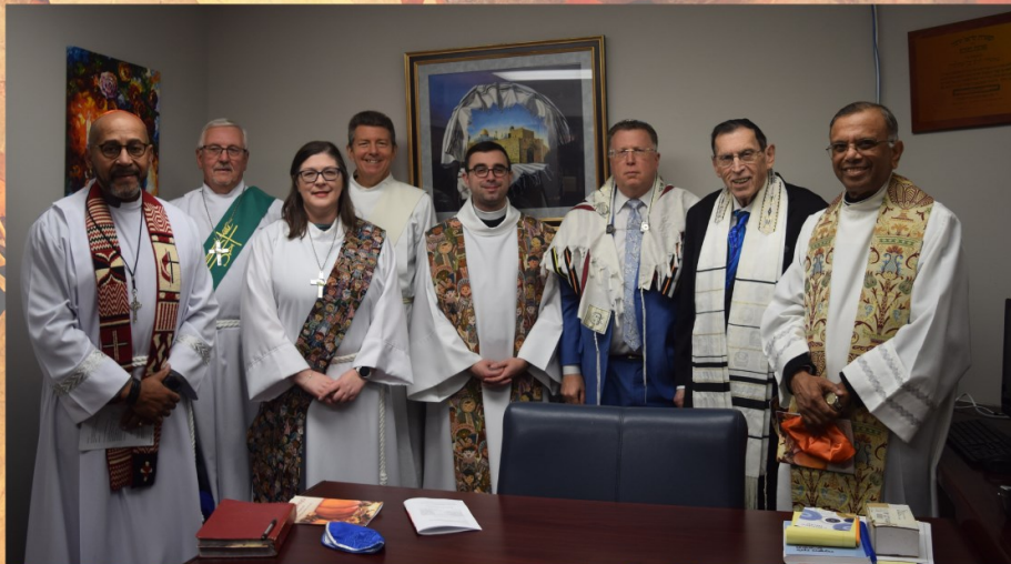
left: our STM participants above: the clergy from Calvary Lutheran, United Methodist, Temple Beth Chai, and St. Thomas More