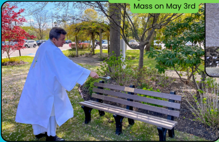
Blessing our new bench after Mass on May 3rd