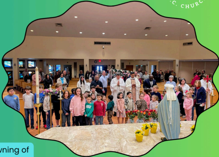
Crowning of Mary at the 9:30 Mass on May 3rd.